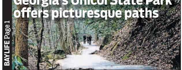
BAYLIFE Page 1

Georgia's Ocala State Park offers picturesque paths